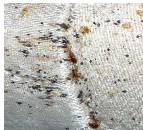
A mattress infested with bed bugs and their eggs.