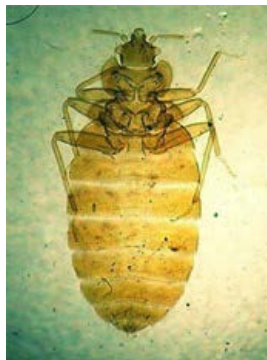
Bites often occur in a linear pattern of three, known as a breakfast, lunch, dinner pattern.

Kalsi's team uses integrated pest management to proactively control bed bugs with education and proper mitigation measures. "We have always viewed bed bugs as a public health matter, but over the last five years we've studied the rising numbers of bed bugs, and it's gone to a phenomenal level."