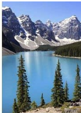
Canada has committed to protect 17% of the world's land & inland waters by 2020.

According to New Brunswick's ministry of natural resources , they plan doubling this average to eight per cent this year.