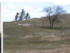
10 Days Later