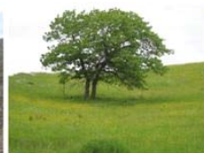
30 Days Later