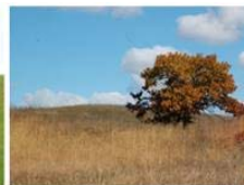
120 Days Later