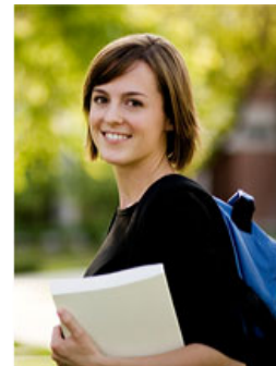
Self-paced PD options can lessen time constraints and lead to a better experience.

Location can also add constraints. As many environmental professionals are required to work out in the field, or travel throughout Canada or overseas, in-class programs may not provide the flexibility they need.