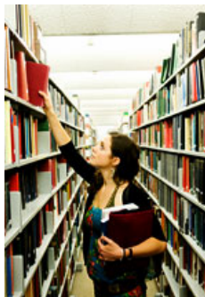
71% of environmental professionals enrolled in job-related courses in 2009.

With so many training and professional development options available, what factors should you consider before enrolling? We break down important considerations below so that you can make the most of new learning opportunities.