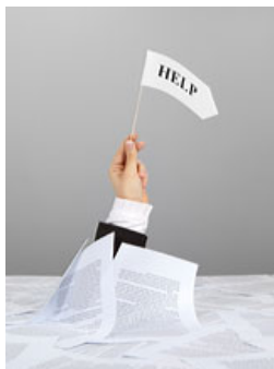
There is a gap between how much training employees say they need, and how much they receive.

Online learning and distance-based programs can provide the opportunity to develop new skills from wherever you happen to be, whether it's out in the field or working from home.