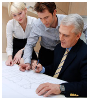
A mentor discussing his work with two protégés.

More than 100 program applications were received over the spring and summer months, with 36 mentorship matches made . Some mentors are so invested in the program that they are mentoring more than one protégé!